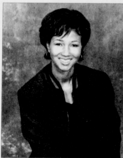
Mae C. Jemison

For more information, log on to jemisonfoundation.org or womenofcolorinflight.org .