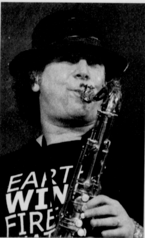
Saxophone virtuoso Boney James is joined by guest singing stars Faith Evans, George Benson and Dwele and Phillip Bailey in his new CD 'Shine.'

With "Shine's" sparkling new batch of material, James is set to take audiences to entirely new places with his eclectic, evocative playing and velvety grooves.