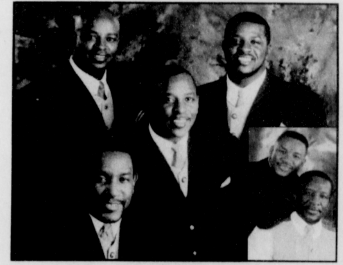
November 1-5, 2006