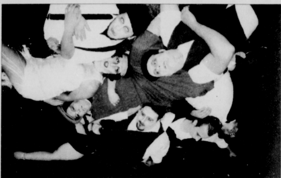
The sketch comedy troupe turned theater company, The Tragedies, presents the horror 'Le Grand Guignol' through the month of October at 'The Little Church' on Northeast 23rd and Sumner just off Alberta Street.