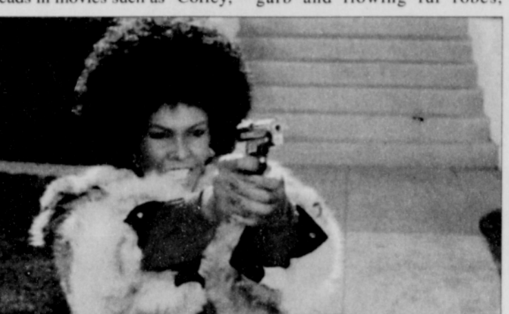
Tamara Dobson was known as the Kung Fu Queen of the 1970s with her role as 'Cleopatra Jones.

doing battle with the white estab- acter was often likened to a female lishment, crooked cops, drug deal- version of James Bond, every bit the fierce fighter and fashion ma-Her character inspired the cre- ven as the iconic spy. Known for