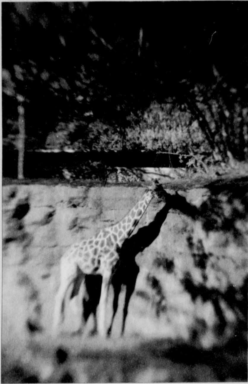
A giraffe browses near the wall of its zoo enclosure.