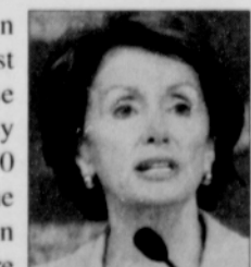
Rep. Nancy Pelosi

(AP) -- Franklin Roosevelt had his first hundred days. House Democratic leader Nancy Pelosi is thinking 100 hours. Time enough, she says, to begin to "drain the swamp" after more than a decade of Repub-