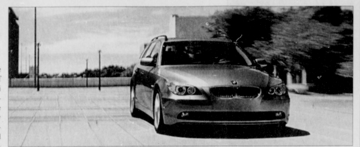
SPECIFACATIONS: $52,095 MSRP; 3.0L, 24 Valve, 255 hp/6600 rpm, 6 cylinder Engine; 6 Speed Automatic Transmission; 19 City/28 Hwy MPG.

As hard as it is to push the "cool" factor behind the wheel of a 5-door station wagon, the 530xi is drenched in "coolness", especially when equipped with the BMW's sport package. This silky dynamo pulls strongly off-theline and right through posted highway speeds without breaking a sweat! BMW has overcome the shortages of a wagon by morphing the exotic shape of the lating the car's bold stance and aggressive lines. In the rebirth, the their sophisticated xDrive, intelligent all-wheel-drive (AWD) technology to the sleek wagon, which BMW refers to as a "touring model". The xDrive is justifiably famous for its ice-handling ability. Making it even better on the slip-