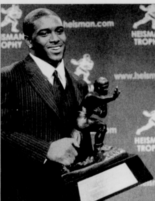
Reggie Bush with the Heisman Trophy he won while at the University of Southern California. Improper benefits while in school could lead to NCAA sanctions against the Trojans and retroactively cost Bush his Heisman Trophy.

"There is no provision under NCAA or conference rules for a game result to be reversed or changed as a result of officiating errors, nor do I believe there should be," he said.