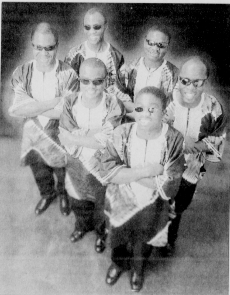
The African Gospel Acapella will perform Sunday, Oct. 1 at the Governor Hotel, downtown, in a benefit for AIDS orphans in Kenya.

Their non-profit organization, Partners in Kenya, is preparing for a stunning benefit dinner Sunday, Oct. 1 at The