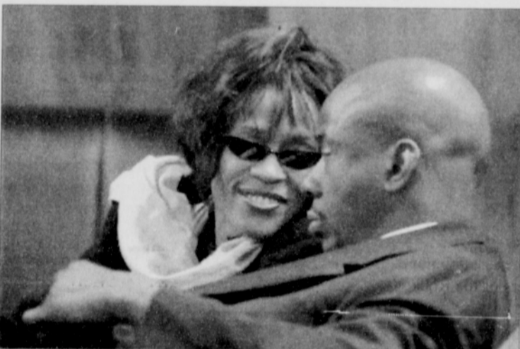
Whitney Houston and her husband, singer Bobby Brown during a court hearing last year in Decatur, Ga.

(AP) -- Whitney Houston and her husband Bobby Brown are breaking up after a 14-year marriage. The couple has had a sometimes tumultuous marriage, and rumors of their breakup have surfaced of-