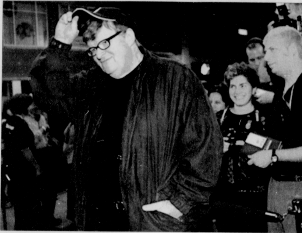
Director Michael Moore arrives at the Toronto International Film Festival to promote his latest film 'Sicko,' a hilarious documentary romp that dissects the health care system.

The "Sicko" excerpts also included a segment comparing Canada's public health care to the privatized system in the United States,