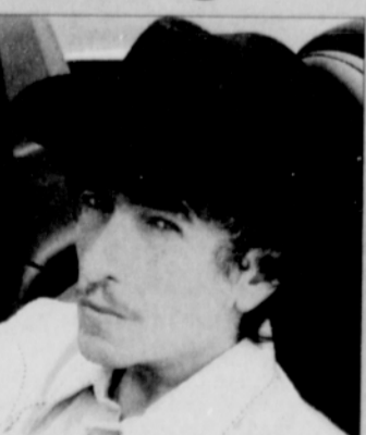
Bob Dylan will perform in Portland just as a new album puts him on top of the charts.

As a vocalist, he broke down the notions that in order to perform, a singer had to have a conventionally good voice, thereby redefining the role of vocalist in popular music.