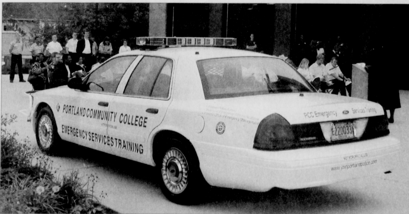
A ceremony marking the donation of a patrol vehicle to the public safety program at the Cascade Campus of Portland Community College in north Portland grows ties between the PCC and Portland Police.

This donation reflects the city's commitment to cultural and racial diversity as they recruit from our department and criminal justice program.