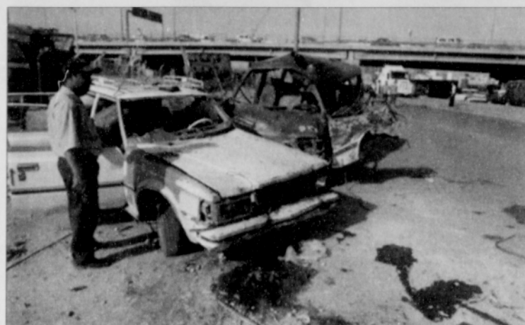
An Iraqi policeman inspect the site of a bomb blast, in Baghdad, Iraq, Tuesday.

Two more bombs ripped through the main Shurja market, also in cen-