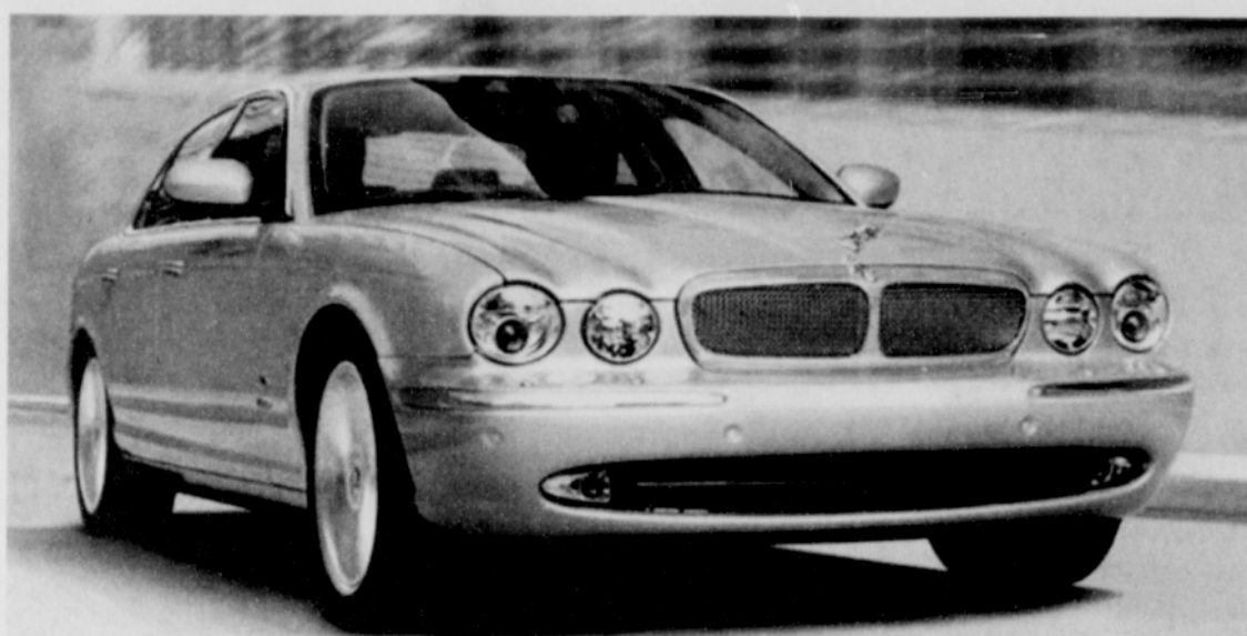
Tested Vehicle Information: Price: $91,995; Engine: 400 HP 4.2L V8; Transmission: 6 speed automatic.

Matched to a six-speed ZF automatic gearbox with adaptive shift technology, the Super V8 can dash to 60 mph in 5.2 seconds, and is able to reach an electronically limited top speed of 155 mph. Meanwhile, front and rear aluminum double-wishbone air suspension and adjustable dampers reportedly provide a comfortable yet firm ride capable of coping with spirited driv-