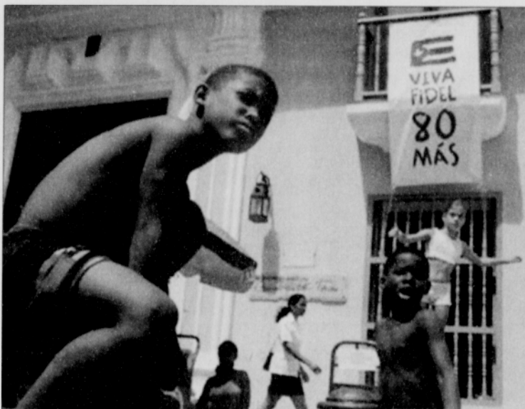
Children in Havana, Cuba take a break near a banner Monday that reads "Long Live Fidel, 80 more" referring to Cuban leader Fidel Castro's upcoming 80 th birthday.

That optimistic assessment has been reinforced by statements from Fidel Castro's inner circle and Latin American allies, who