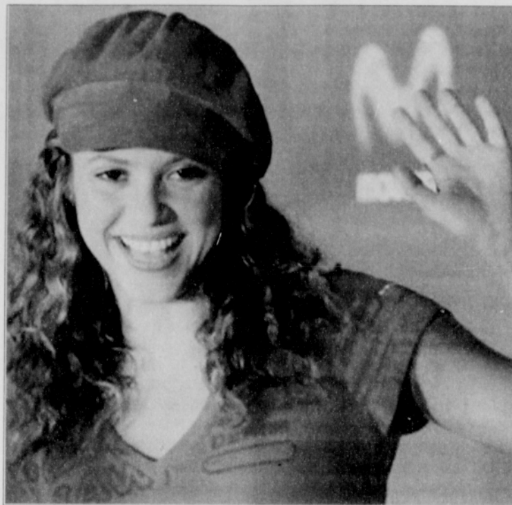
Colombian pop singer Shakira speaks to the press during the presentation of her new album, "Oral Fixation" in Mexico City.

Shakira has been singing mostly in Spanish while touring Latin America but will switch largely to English when the U.S. leg of the tour opens Aug. 9 in El Paso, Texas. She also plans performances in New York, Miami and Los Angeles.