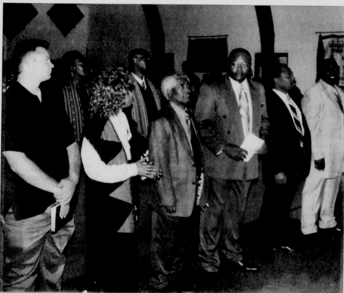
Representatives from North Portland Bible College working together for the common good in the community they serve.