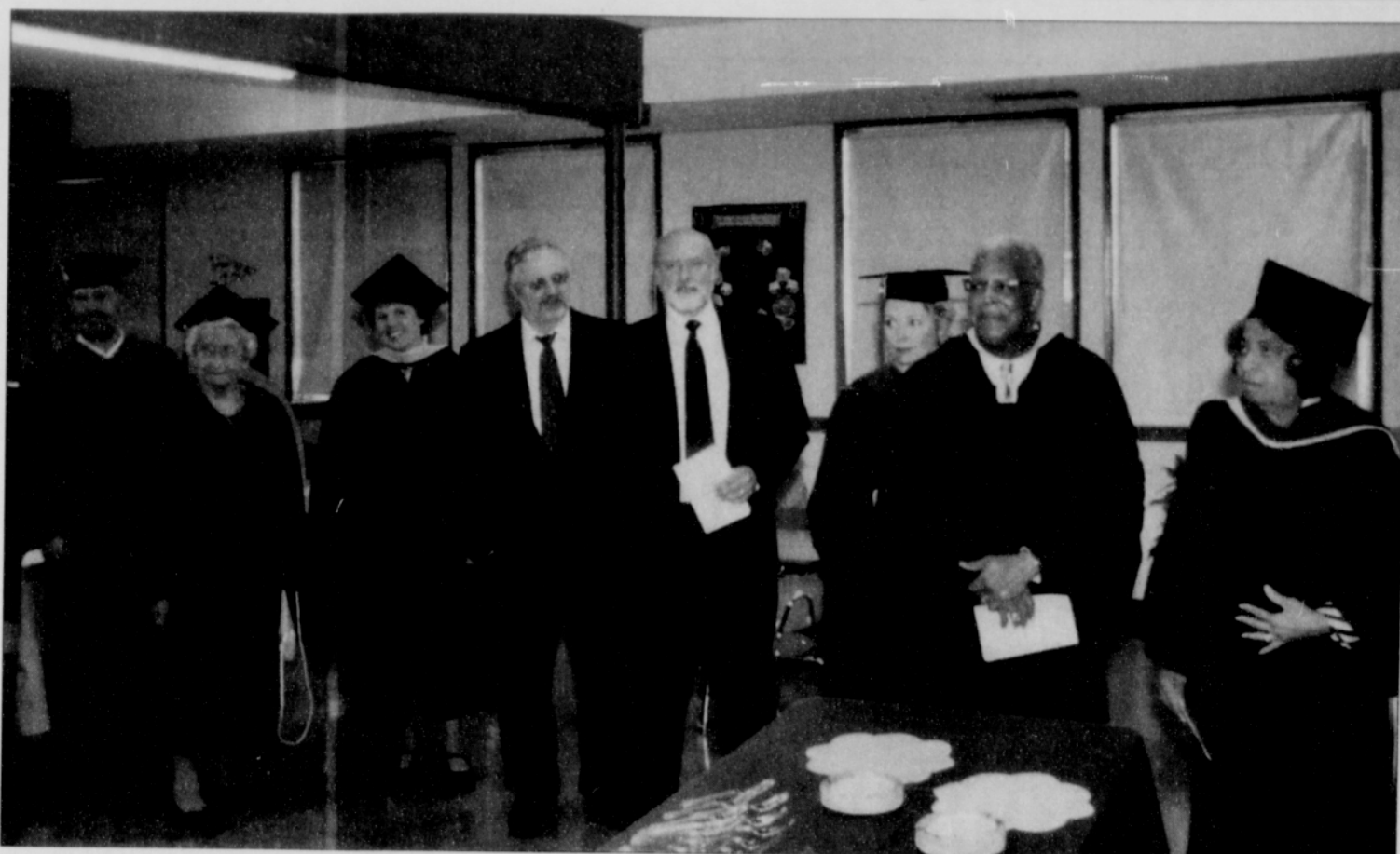
North Portland Bible College's 2006 Honors and Graduation services are held at Berean Baptist Church.

Course content often provides a foundation for racial reconciliation and positive cross-cultural relationships by a natural association of people whose lifestyles have