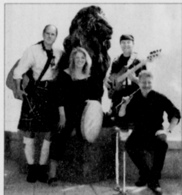
Craicmore, a Celtic musical group, takes the Washington Park Summer Festival stage on Monday, Aug. 7.

Recreation. "The Washington Park concerts are a beloved tradition in Portland, and we are especially excited about this year."