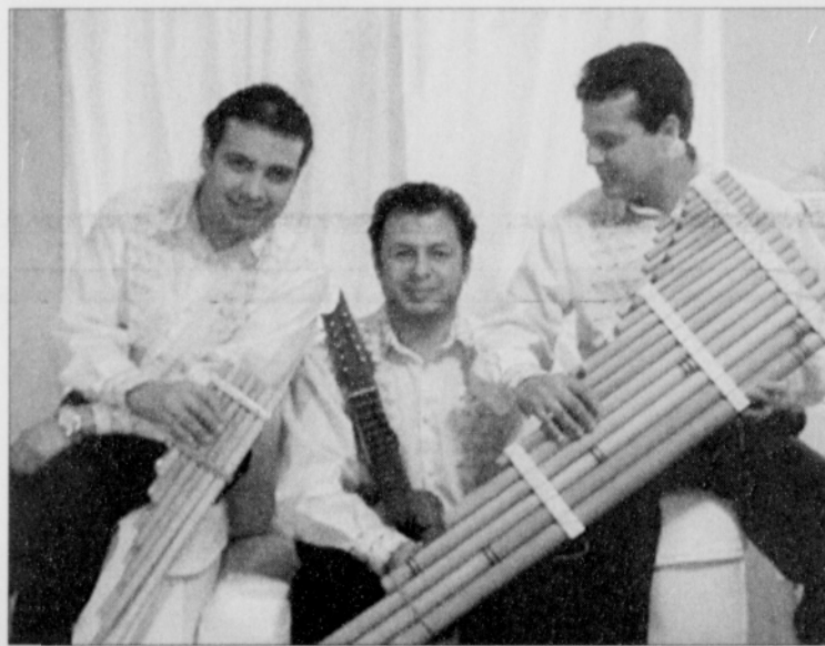
The Latin American folk group Grupo Condor performs Saturday, Aug. 5 at the free Washington Park Summer Festival.

The lineup offers a fabulous destination to thousands of fami-