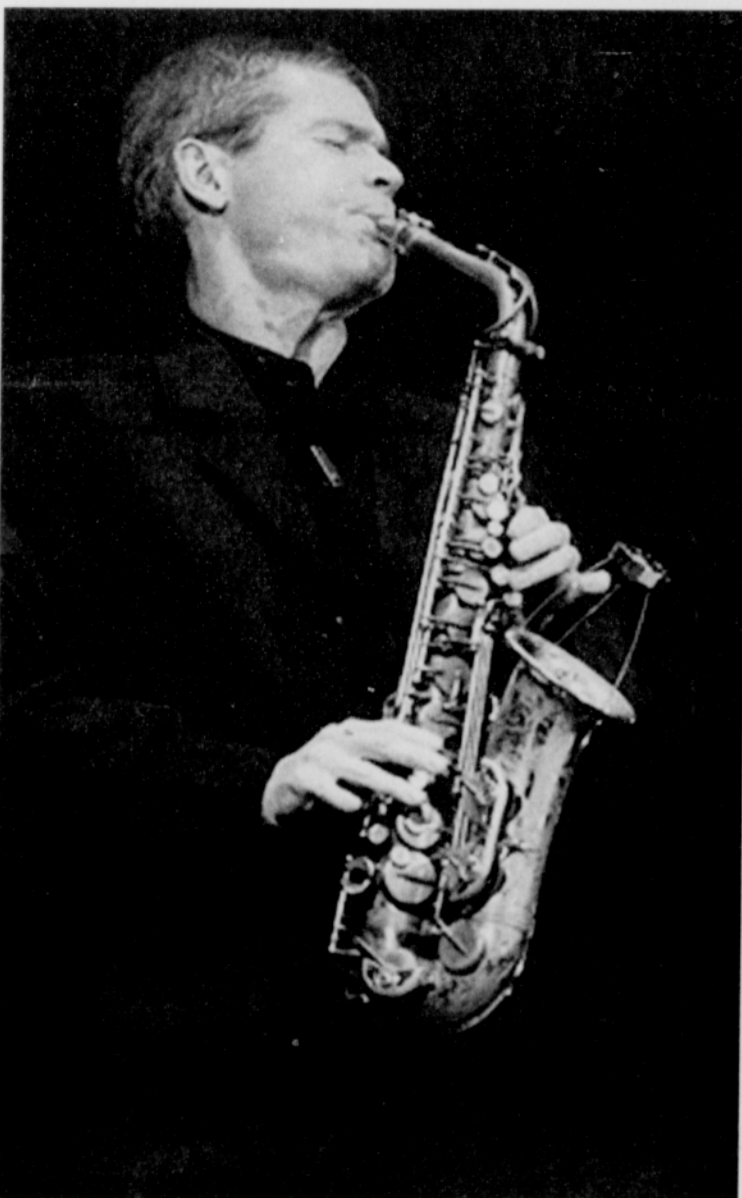
Saxophone legend David Sanborn will headline one of Oregon's longest running jazz festivals this weekend as the Mt. Hood Jazz Festival celebrates 25 years.