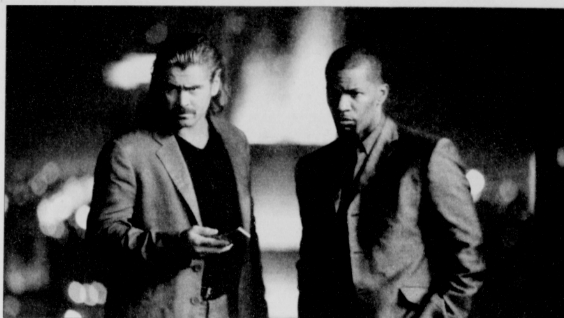
Colin Farrell (left) and Jamie Foxx go deep undercover in the feature film 'Miami Vice' opening nationwide Friday, July 28.

and dead smart. He lives with a gorgeous Bronx-born intel-analyst Trudy, played by British actress