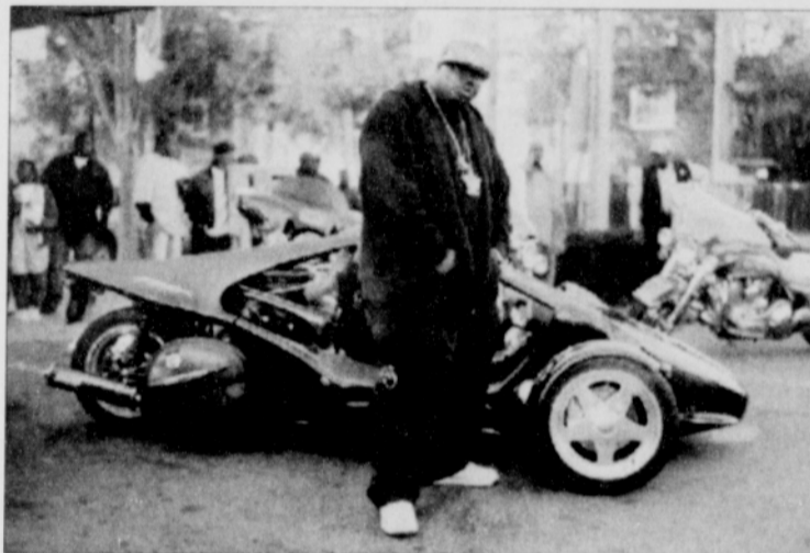
Bay Area hip-hop legend E-40 will be performing live at the Roseland Theater on Friday, July 28.

E-40, "The Ambassador of the Bay," has recorded 12 albums over the past 15 years, three of them gold and one of them platinum. With his latest album, he once again reinvents himself by introducing the nation to a movement that has been bubbling in his native Bay Area for the past few years - Hyphy. Like Crunk in Atlanta or Screw music in Houston, Hyphy music brings a