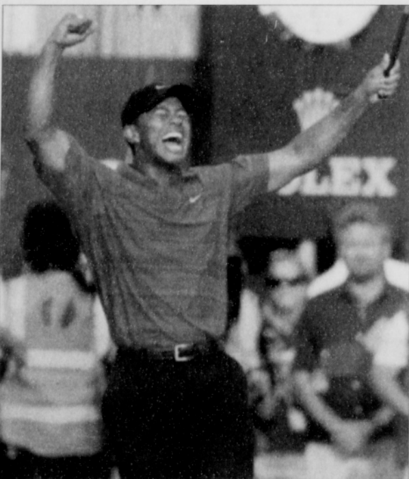
Tiger Woods celebrates after winning the British Open Golf Championship at the Royal Liverpool Golf Course in Hoylake, England Sunday.