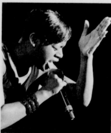
"American Idol" 2004 winner Fantasia Barrino

Tickets are $10. For reservations, call 503-232-5375.