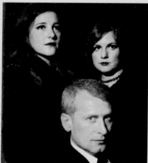
The lines between truth and love get crossed in the dark comedy 'Private Eyes.'