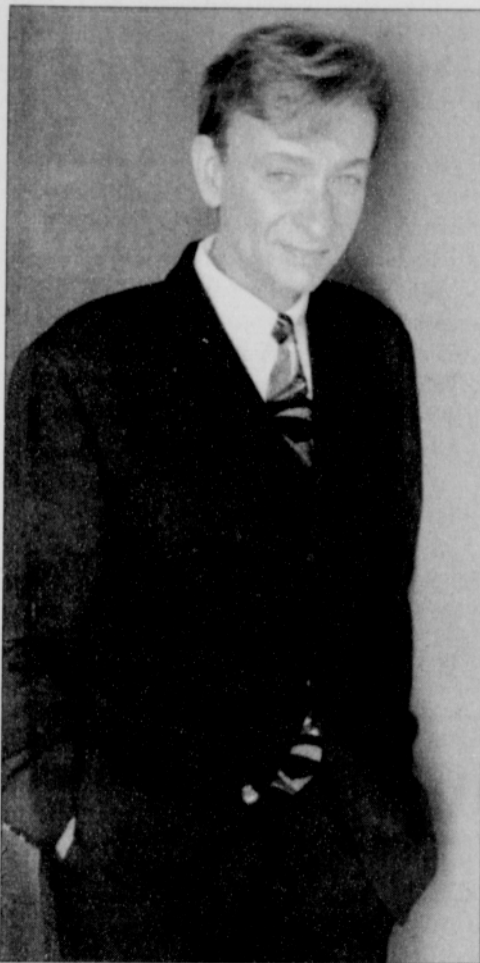
Bobby Caldwell headlines the Allstate Smooth Jazz 105.9 Summer Concert coming Sunday to PGE Park.

The Allstate Smooth Jazz 105.9 Summer Concert takes place at PGE Park on Sunday, July 23, with a line-up of eight artists on two stages, featuring some of the country's top jazz musicians and Portland's finest performers.