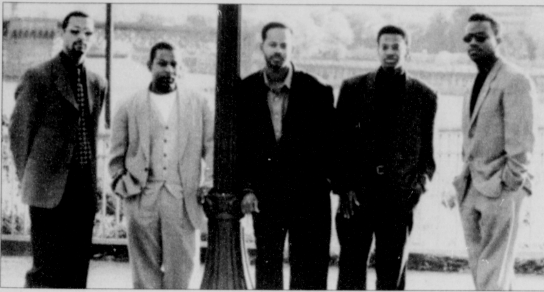
N'Touch is a Portland-based jazz band that skillfully weaves R&B, Latin, gospel and other urban styles.