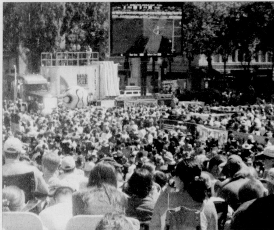
8,000 soccer fans packed into downtown's Pioneer Square on Sunday, to catch Italy and France vie for the World Cup Championship. The Italians suffered through off-field match fixing scandal, then extra-time during the final match, to prevail 5-3 over France.

"It went smooth as silk," he said. "The World Cup in 2010 will take place in South Africa, and it's almost a given that we'll do this again."