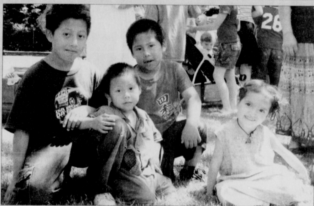
Kids enjoy a Summer Celebration at Montavilla Park in northeast Portland.