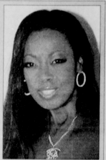
Star Jones Reynolds