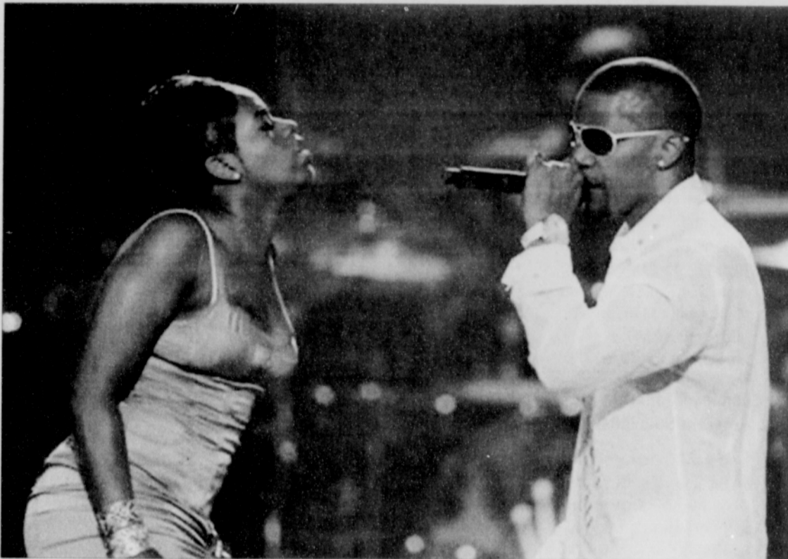
Jamie Foxx (right) and Fantasia perform during the 6th annual BET Awards in Los Angeles.

nized for lifetime achievement, accepted the honor in star-studded style.