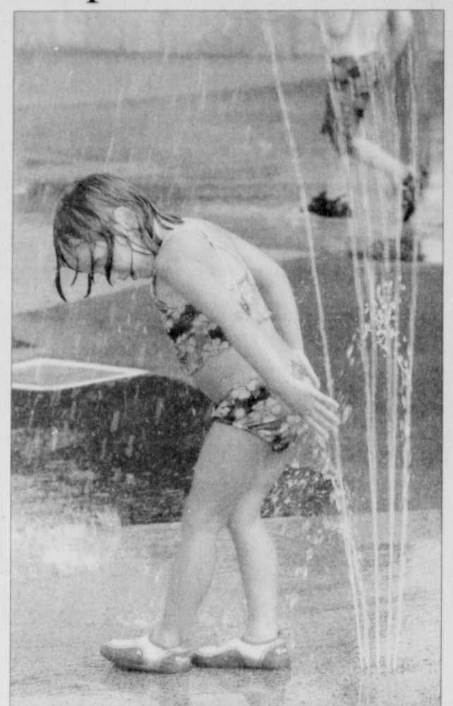
www.metro-region.org/bluelakeorcall Water that sprays, gushes, dumps and pours is the attraction at Blue Lake Park's new water spray ground.