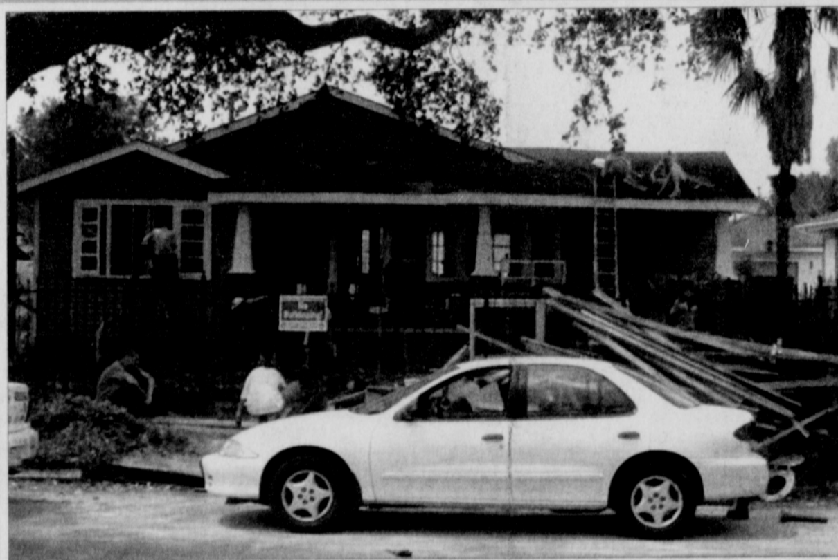
A flood-damaged house in the Lower 9th Ward of New Orleans gets the needed repairs and cleanup from a team of volunteers. The site will be used for a free health clinic.