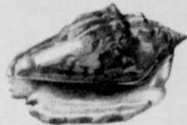
Fig. 4 Strombus Lentiginosus