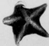
Fig. 6 Bat Star

Tackle a wave. Follow a fish. Save some seashells by the seashore. You can do just about anything, just about anywhere with an RV. Go to GoRVing.com for a free video and see an RV dealer. WHAT WILL YOU DISCOVER?