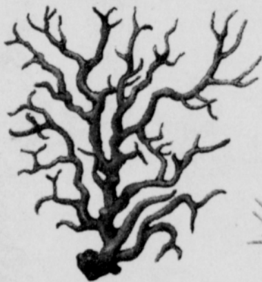
Fig. 3 Precious Coral