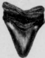
Fig. 1 Shark Tooth

Take those miserably mundane weekends and SPLASH SOME COLD WATER ON THEIR FACE.