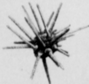
Fig. 5 Lance Urchin