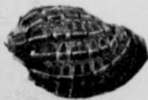
Fig. 2 Harpa Major