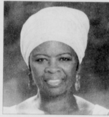
The 'Soul Queen of New Orleans' Irma Thomas

The fireworks will be the largest July 4th show in Oregon with shots from three barge locations at once. The main body of the show will contain hundreds of unique effects. The grand finale will be will transi-