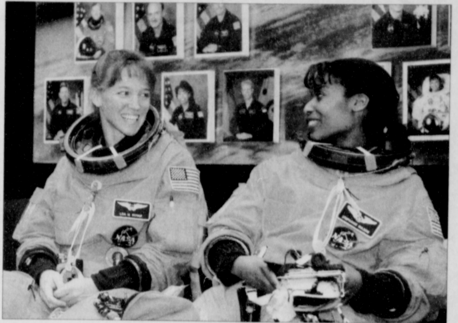
Astronauts Lisa Nowak (left) and Stephanie D. Wilson take a brief break from training at NASA's Johnson Space Center

Wilson began her NASA career in Southern California at NASA's Jet Propulsion Laboratory. She worked on the Galileo mission to Jupiter from 1992 to 1996, responsible for the spacecraft's antenna pointing accuracy.