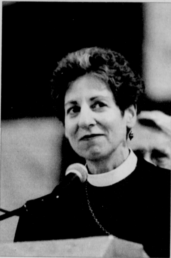
The newly-elected presiding bishop of the Episcopal Church, Katharine Jefferts Schori, speaks to the House of Deputies after her confirmation vote Sunday.

"I will bend over backward to build relationships with people who disagree with me," she pledged at a news conference.