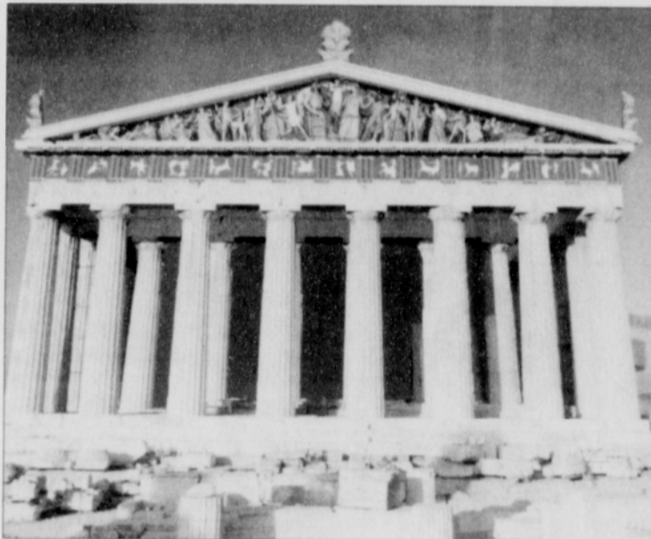
The architecture of ancient Greece.

Helping bring these questions into contemporary focus with her trademark wit and style is the film's narrator, Greek-American Nia Vardalos, the writer and star of the runaway hit feature, My Big Fat