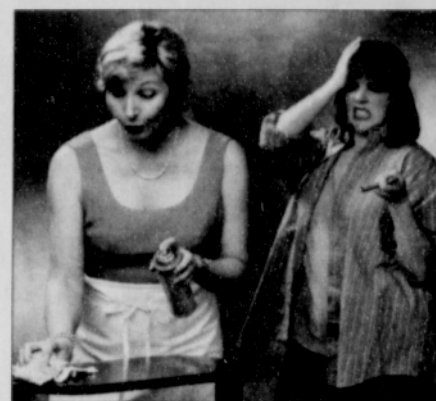
The Odd Couple.

Female Odd Couple -- Integrity Production presents a female version of the beloved Neil Simon classic "The Odd Couple" at 8 p.m. Thursdays, Fridays and Saturdays and 4 p.m. on Sundays through June at Theater/Theater!, 3430 S.E. Belmont St. Tickets are $15.