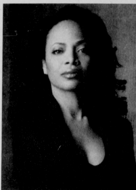
Actress Gina Ravera stars as Detective Irene Daniels of the LAPD Priority Homicide Squad on the hit TNT drama "The Closer."