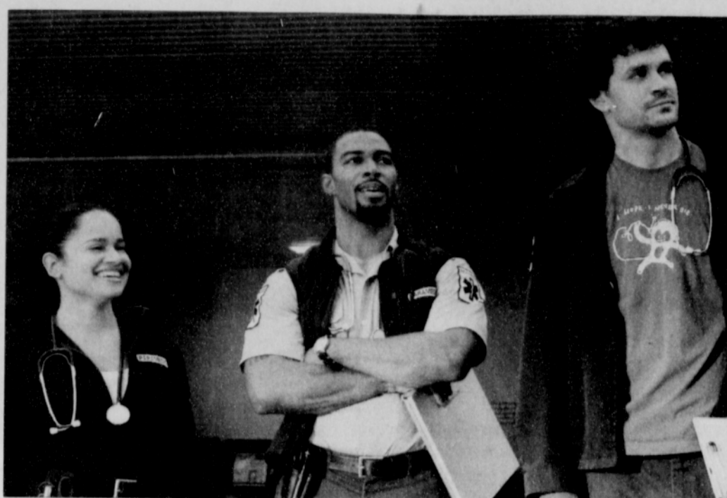
Portland Emergency Medical Technicians are portrayed in the new drama 'Saved' starring Tracy Vilar (from left), Omari Hardwick and Tom Everett Scott.