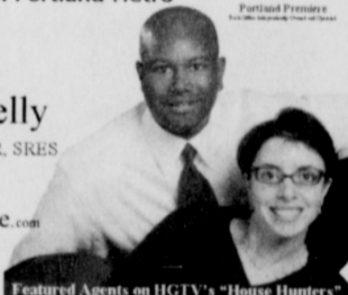
Featured Agents on HGTV's "House Hunters"

www.SellingPortlandRealEstate.com 503-330-5488 17700 SW Upper Boones Ferry Rd Portland, OR