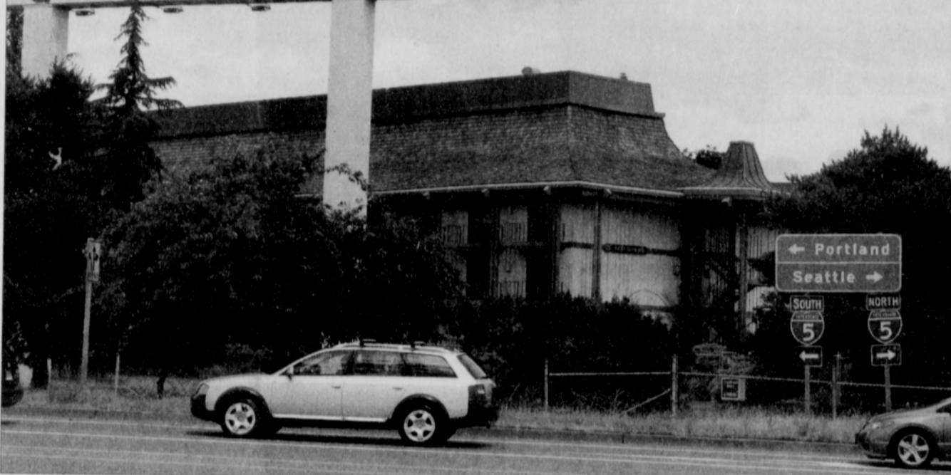
The Thunderbird Hotel at Jantzen Beach could be torn down to make room for a new Wal-Mart.