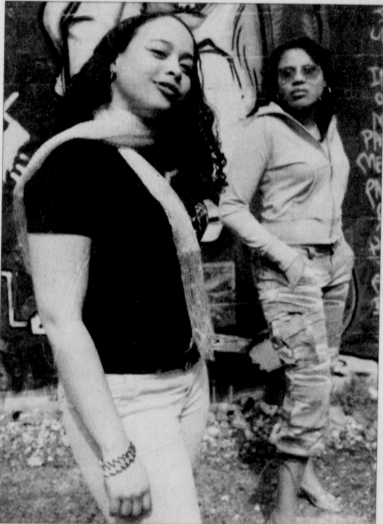
The soulful female group Siren's Echo will perform Wednesday, June 14 at Wonder Ballroom, 128 N.E. Russell St., in a concert promoting safe sex and a summer safe from violence.