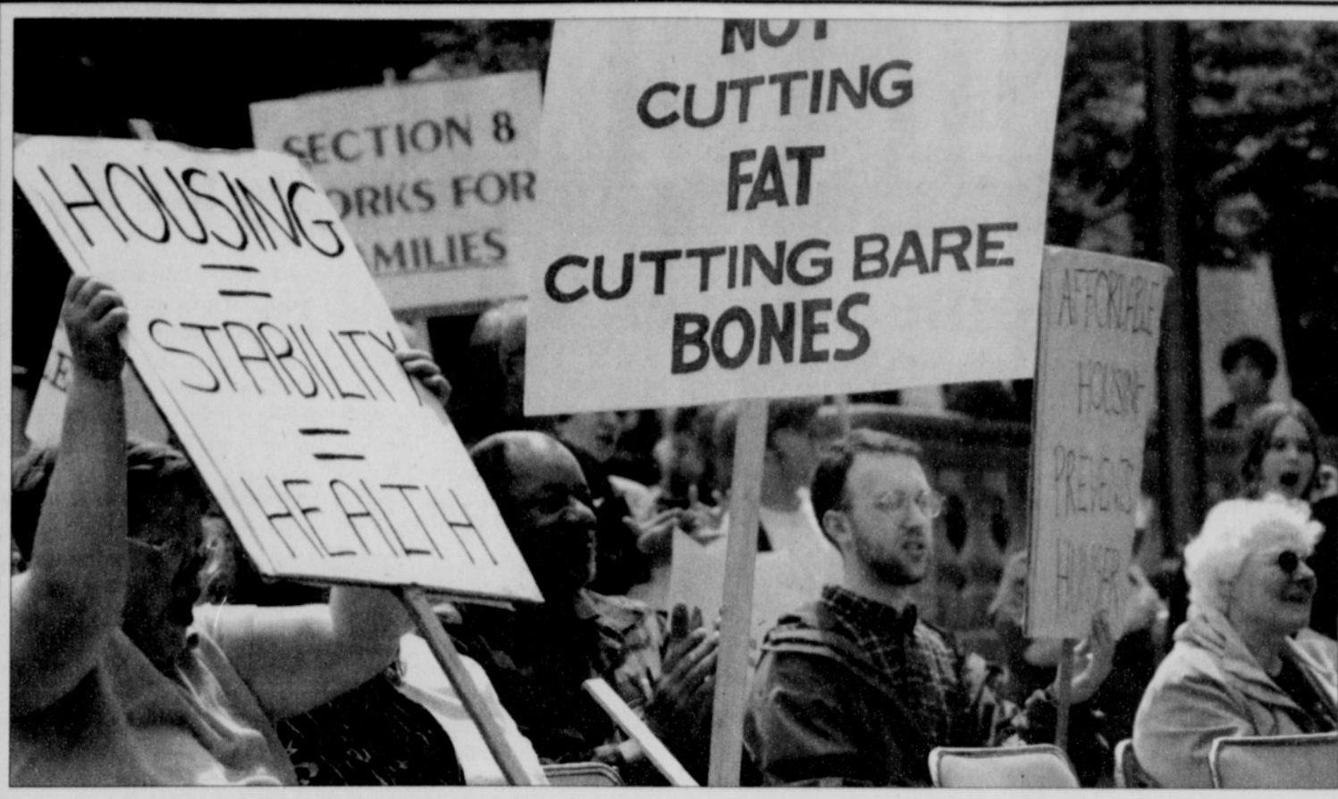
Local residents bring their demands for fair and affordable housing to City Hall.