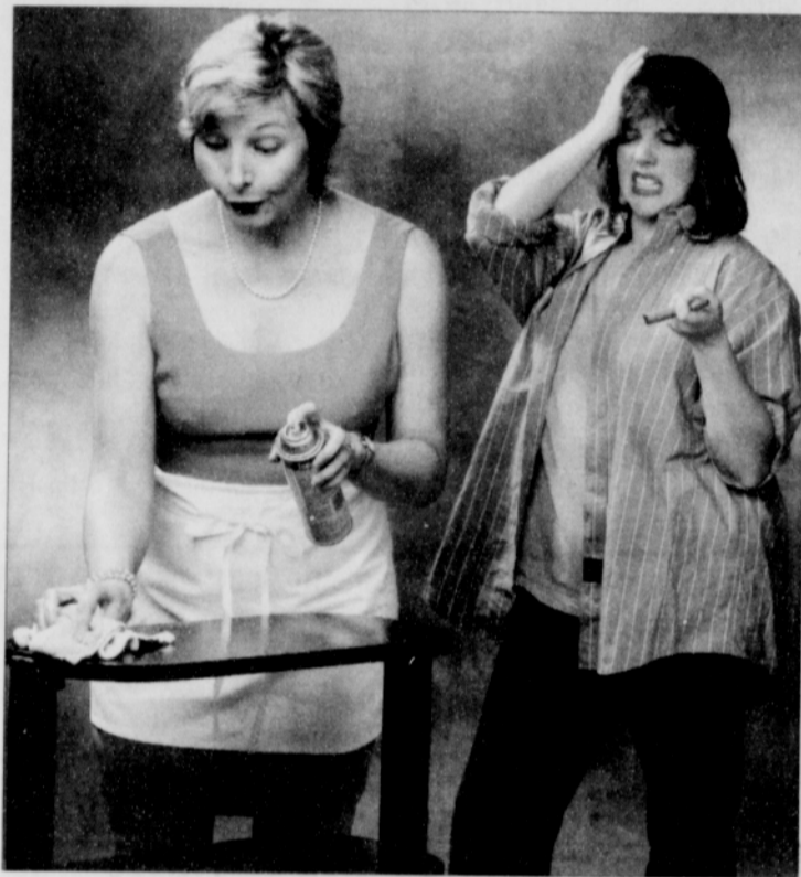
Integrity Productions presents a female version of 'The Odd Couple' by Neil Simon at Theater/Theatre! 3430 S.E. Belmont.

June shows are each Thursday, Friday and Saturday at 8 p.m. and Sundays at 4 p.m. Tickets are $15 with discounts available.