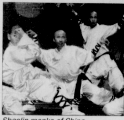
Shaolin monks of China.