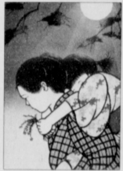
Love Now exhibit

Belly Dance Classes -- Caravan Studios offers classes in belly dance, African dance and more. Visit www.gypsyncaravan.us .