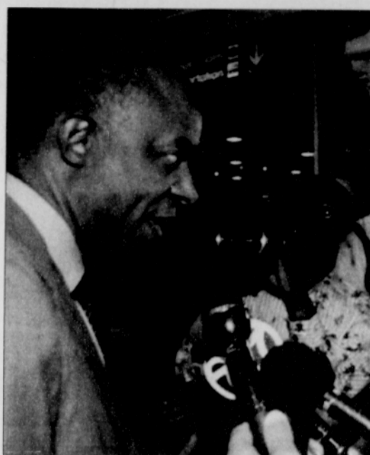
Rep. William Jefferson, D-La., makes a statement upon his arrival at Washington's National Airport, Monday, May 22, 2006.

He called the weekend search of his Capitol Hill office "an outrageous intrusion into separation of powers between the executive branch and the congressional branch, and no one has seen this in all the time of the life of the Congress."