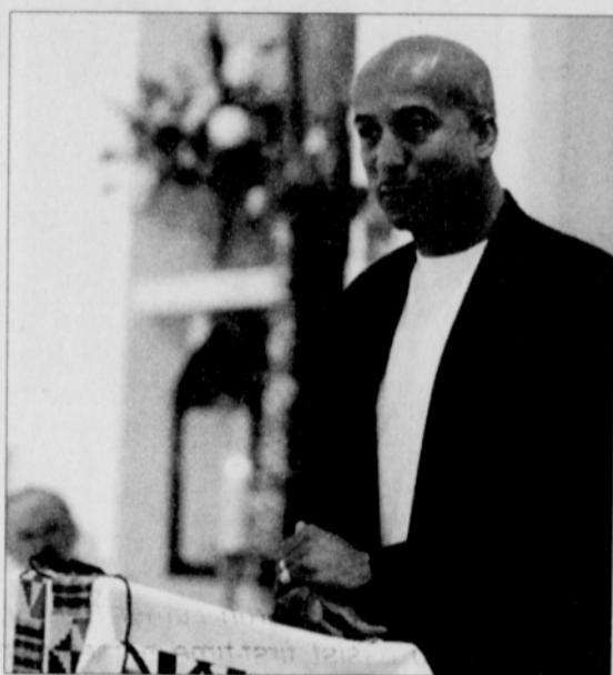
New Orleans Mayor Ray Nagin attends a Mass at St. Peter Claver Catholic Church in New Orleans on Sunday, the day after his re-election.

Nagin said he pressed Bush to help accelerate