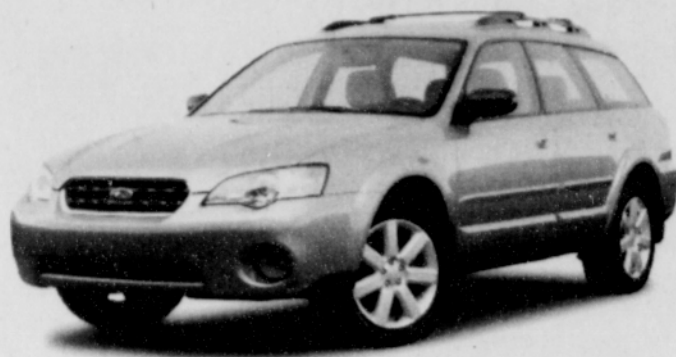
Tested Vehicle Information: $28,744 Price; 2.5 Liter Engine, 4 cylinders; Manual five speed Transmission.

opposed boxer-style engine and a five-speed manual transmission. The engine makes 175 horsepower and 169 lb.-ft. of torque, but it doesn't feel sluggish unless you saddle it with the optional four-speed automatic transmission. Standard equipment includes an eight-way power adjustable driver's seat, tilt steering wheel, floor mats, cruise control, a 120-watt stereo with CD player, a trip computer, and air conditioning. Of course, power