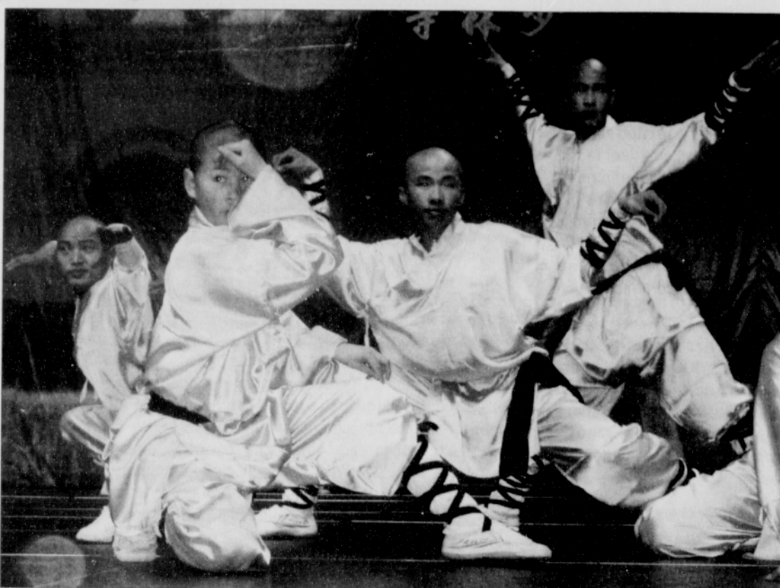
The Shaolin Kung Fu Spectacular performs May 31 at the Arlene Schnitzer Concert Hall.

The 20 members of the troupe have dedicated their lives to at least eight hours of training per day, in addition to farming, meditating, and studying the scripture of Buddhism. The Shaolin monks