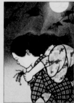
Love Now exhibit

Animation at OMSI - Explore how art, math, science, and technology come together in the exciting world of animation at the Oregon Museum of Science and Industry. Experiment with storyboarding, character design, movement, timing, filming, sound, editing and more as you explore the process of animation and create your own animated sequences. For admission and tickets, call 503-797-4000.