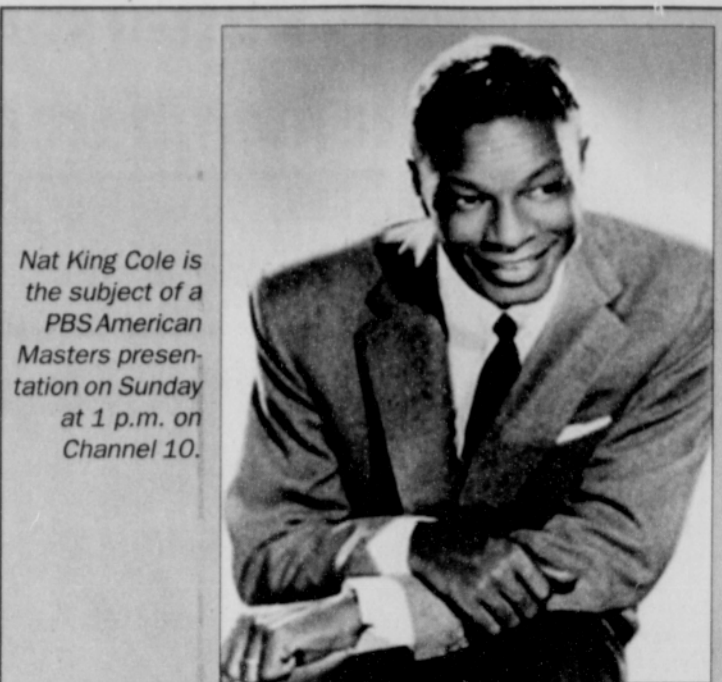
Nat King Cole is the subject of a PBS American Masters presentation on Sunday at 1 p.m. on Channel 10.