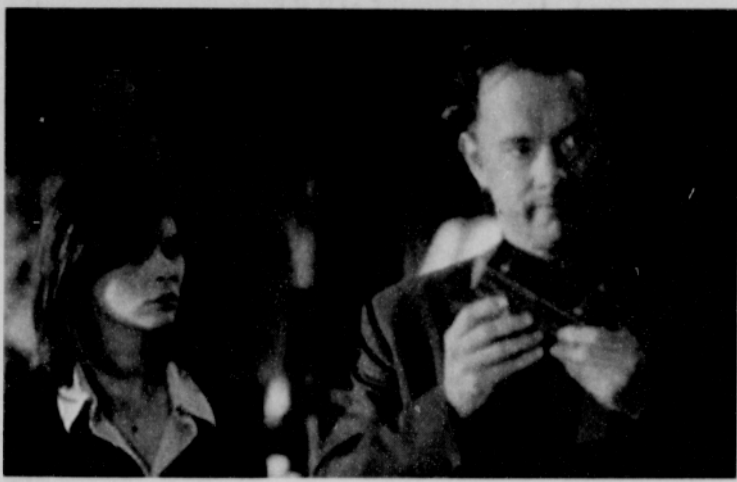
Actors Audrey Tautou and Tom Hanks in a scene from the suspense thriller "The Da Vinci Code," based on the novel by Dan Brown.