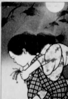
Love Now exhibit

Live Music Every Night -- Kick off your week with live jazz every Sunday at 9 p.m. at The Blue Monk (3341 SE Belmont). Participate in a mixed-media open mic night each Monday at the Back to Back Café (614 East Burnside). The Thorn City Improv, featuring members of Old Dominion, Quivah, The Chosen and The Black Notes, perform at Conan's (3862 S.E. Hawthorne) every Tuesday at 10 p.m.