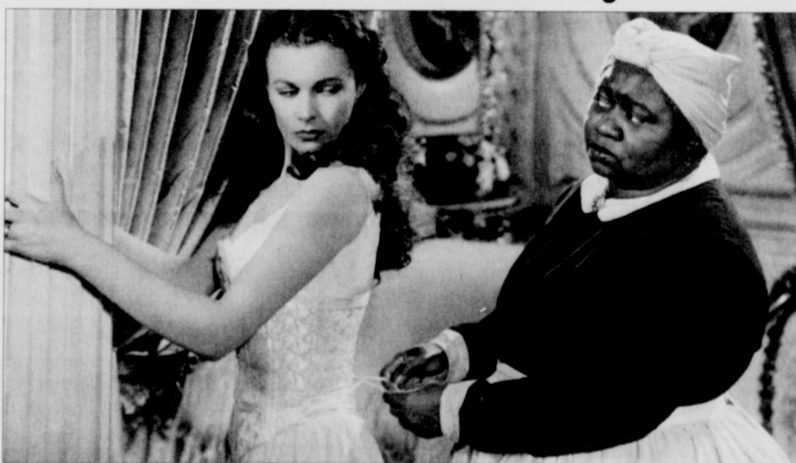
The division of race in the South around the time of the Civil War is captured in the film 'Gone With the Wind,' one of the movies to be featured in May during 'Race & Hollywood: Black Images on Film' on the Turner Classic Movies cable network.