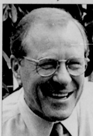
Gov. Ted Kulongoski

Under Kulongoski's administration significant businesses, including Amy's Kitchen, Ya-