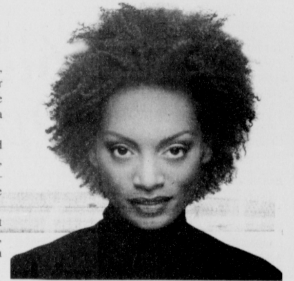
Bold hair colors like Textures & Tones' Blazing Burgundy will complement the subdued black, white and gray accents of the latest summer trends, according to hair styling experts.

"With such a bold but basically colorless silhouette, more attention will be paid to your hair," says Clairai Color and Style Master Ingridette Pope, whose work can be seen on music videos and in national