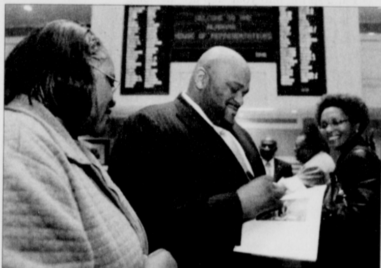
"American Idol" winner Ruben Studdard signs autographs after launching an after-school program, called "The Music Alternative Project."

"I am a product of the public school system... and I had a lot of friends involved in gang activity," Studdard recently told