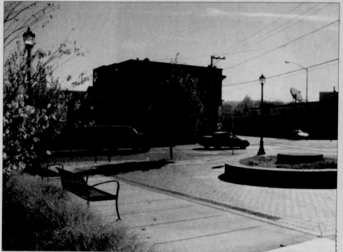
A small parkway brings a welcome mat to the Lents neighborhood of southeast Portland.

Area non-profits will also participate including Zenger Farms, Rose Community Development