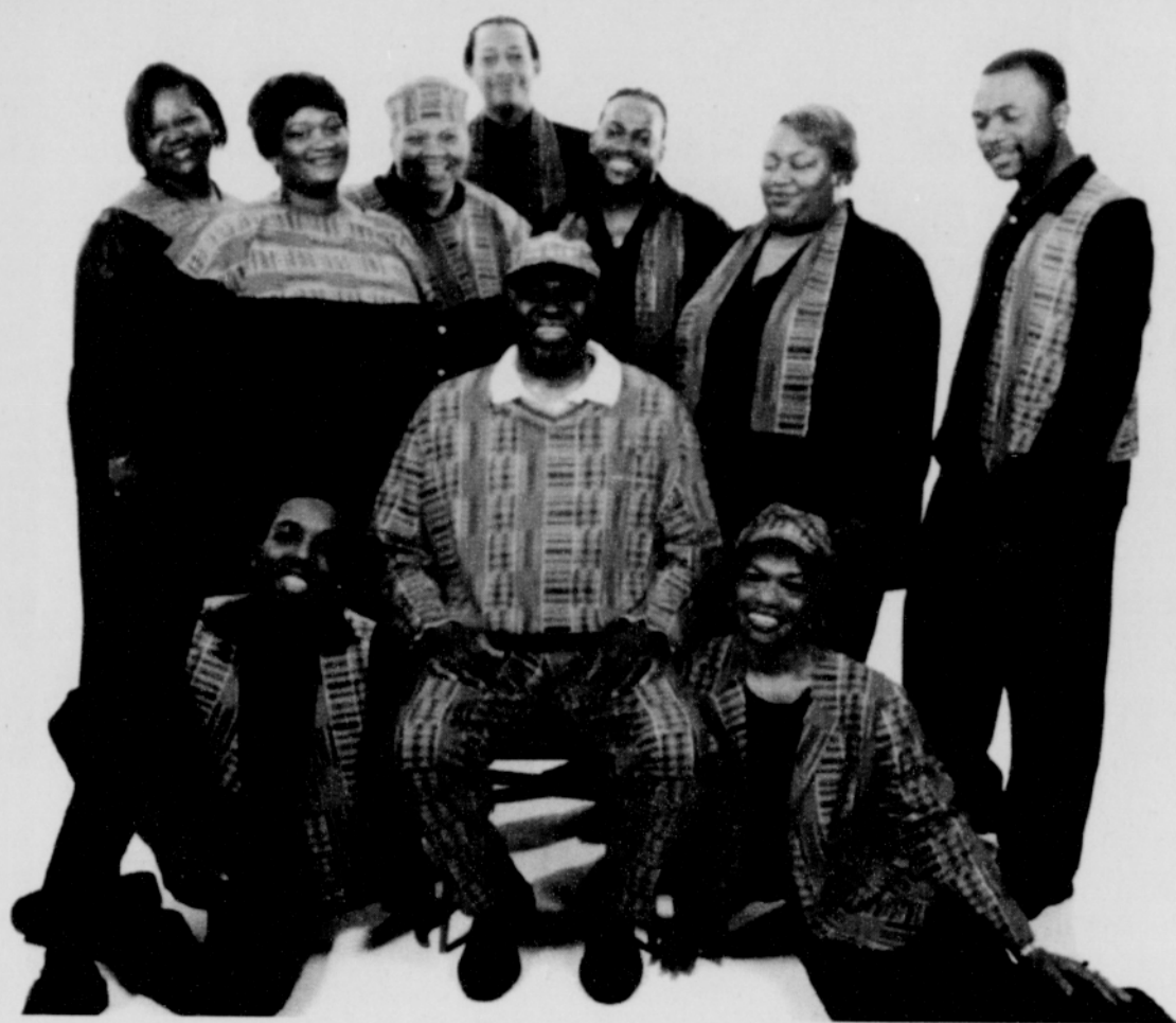
The world famous Harlem Gospel Choir will perform blues, jazz and Gospel April 13 at the Columbia Theatre in Longview.