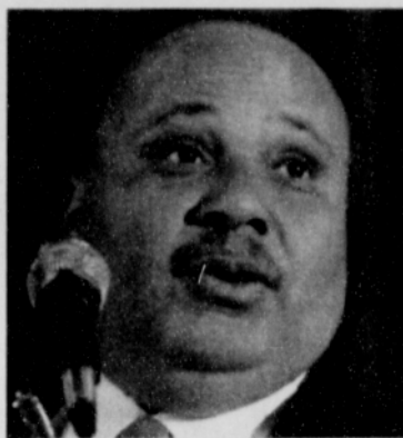
Martin Luther King III